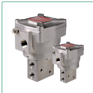
Reliable, industry proven solenoid technologies